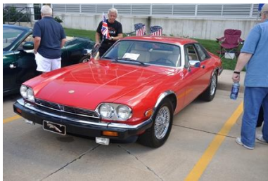
1991 Jaguar XJS