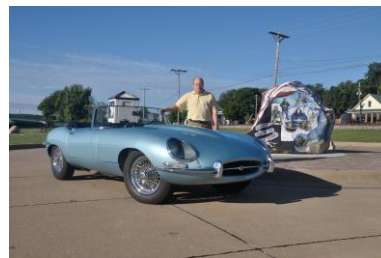
1963 Jaguar XKE