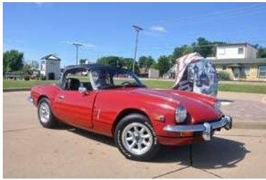
1970 Triumph Spitfire