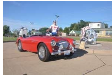
1956 Austin Healey 100-4