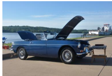
1968 MG B