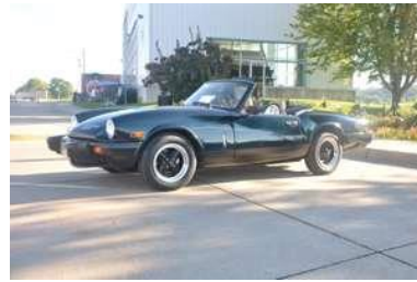
1980 Triumph Spitfire