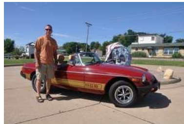
1979 MG B