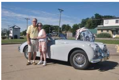
1956 Jaguar XK140