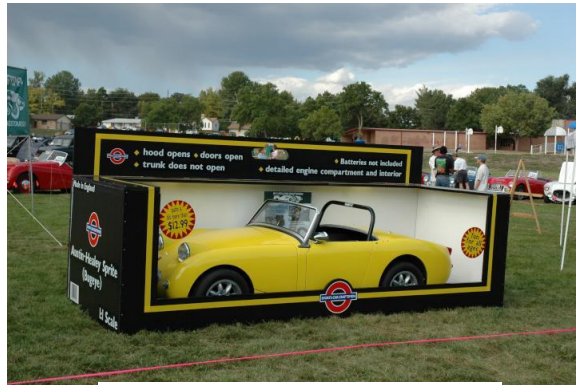
1960 Austin Healey Sprite (boxed)