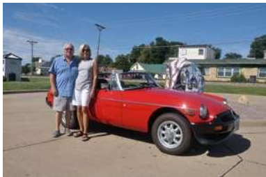
1978 MG B