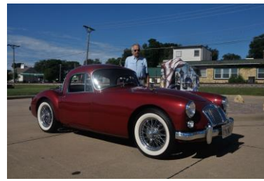
1959 MG A