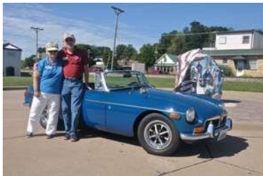
1970 MG B