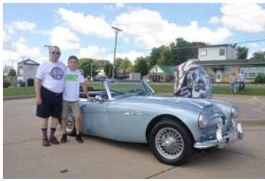
1962 Austin Healey 3000