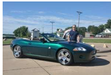
2007 Jaguar XK8