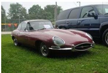
2016 Sweetcorn Festival – Oneida, IL