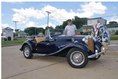
1951 MG TD