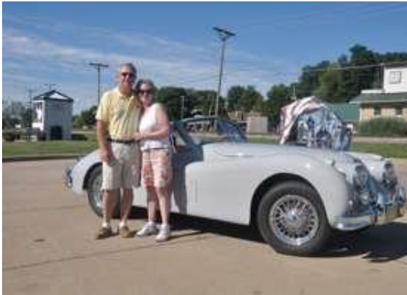
Best in Show – 1956 Jaguar XK 140

Heartland Autofest – 6 August 2016 – Le Claire, Iowa