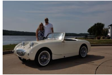
1959 Austin Healey (Bugeye) Sprite