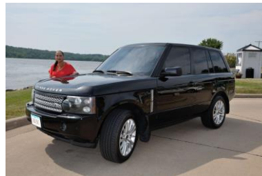
2020 Land Rover Range Rover