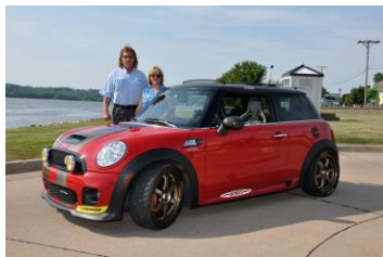
2009 Mini Cooper