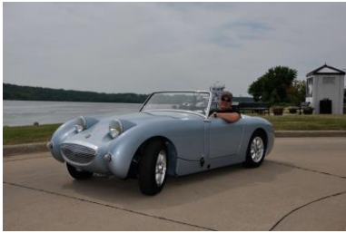
1960 Austin Healey (Bugeye) Sprite