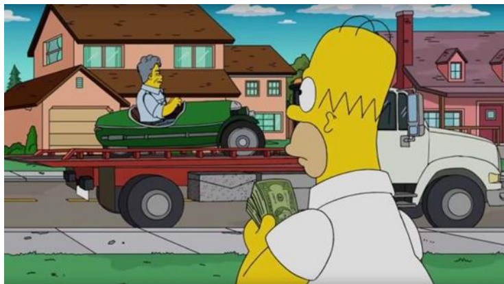
Jay Leno with Morgan Three Wheeler on "The Simpsons"