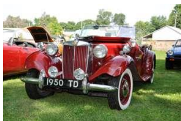
2018 Sweetcorn Festival – Oneida, IL