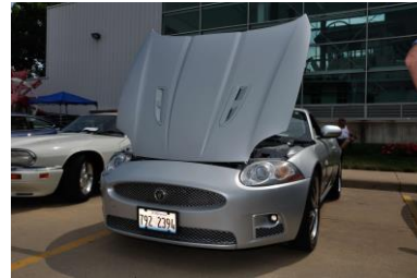
2007 Jaguar XKR