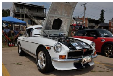
1975 MG B