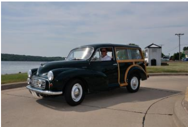
1958 Minor Traveler