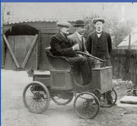
Name this car – It's cute!

It is generally acknowledged that the first really practical automobiles with petrol-powered internal combustion engines were completed by several German inventors working independently around 1885.