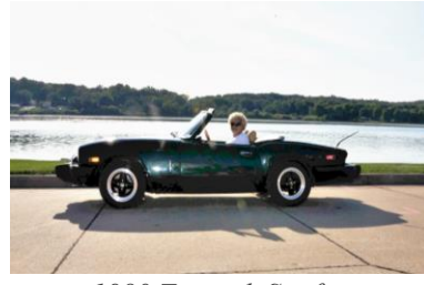
1980 Triumph Spitfire