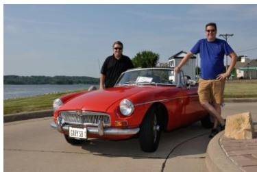
1969 MG B