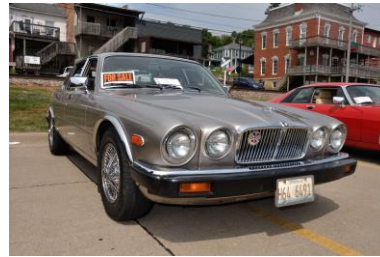
1987 Jaguar XJ6