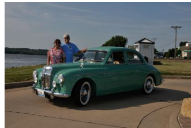
1957 MG ZB Magnette