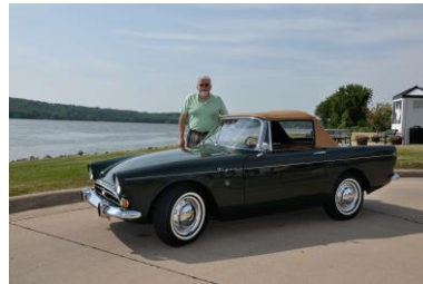
1965 Sunbeam Tiger