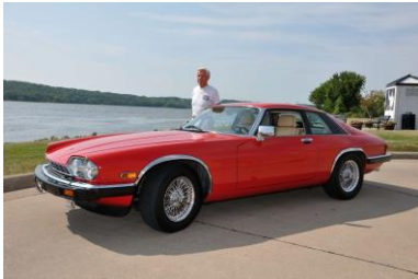
1991 Jaguar XJS CE