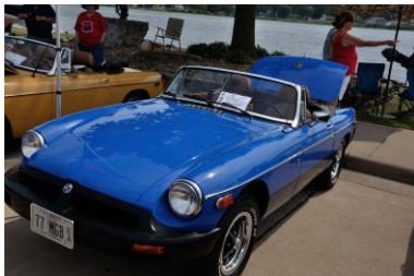
1977 MG B