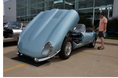
1963 Jaguar XKE