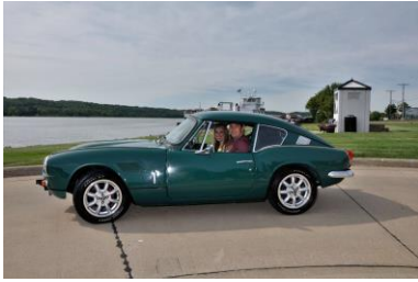
1968 Triumph GT6