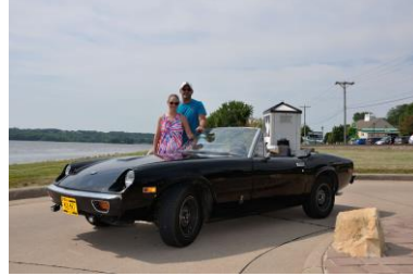
1974 Jensen Healey