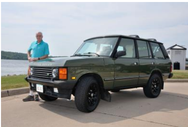
1990 Land Rover Range Rover