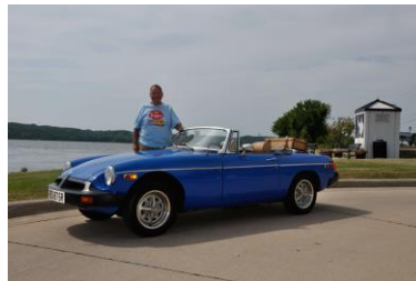
1977 MG B