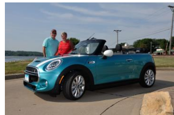
2017 Mini Cooper