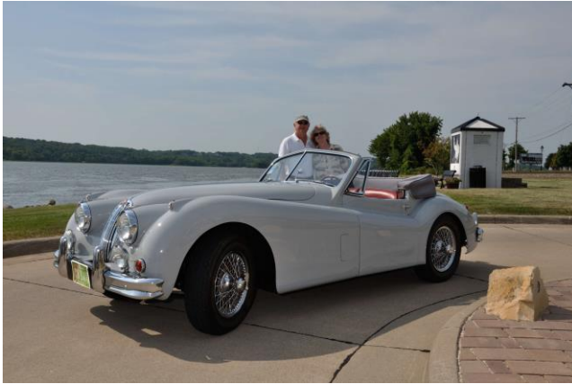
Best in Show – 1956 Jaguar XK140

The 2018 QCBAC Heartland British Autofest took place 4 August 2018 in Le Claire, Iowa. The weather was great and there were many interesting British cars along the Mississippi River. More pictures of the show are available at https://www.glenjust.com/carshows/LeClaire2018