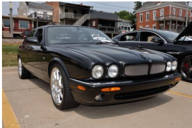
2002 Jaguar XJR