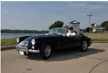
1960 MG A