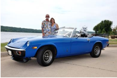
1974 Jensen Healey