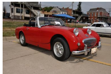
1974 MG Midget