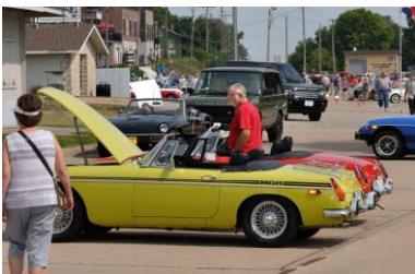
1974 MG B